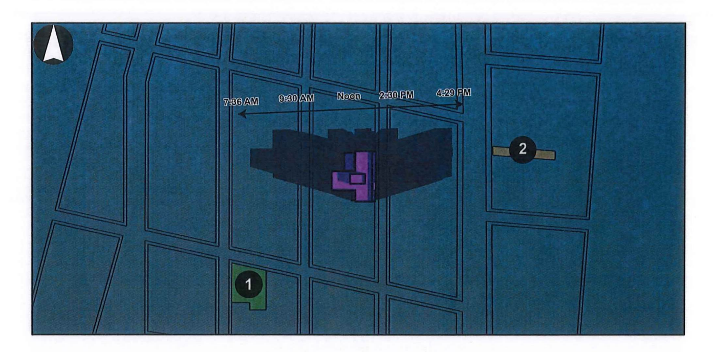
Figure B-2a Tier 3 Screening