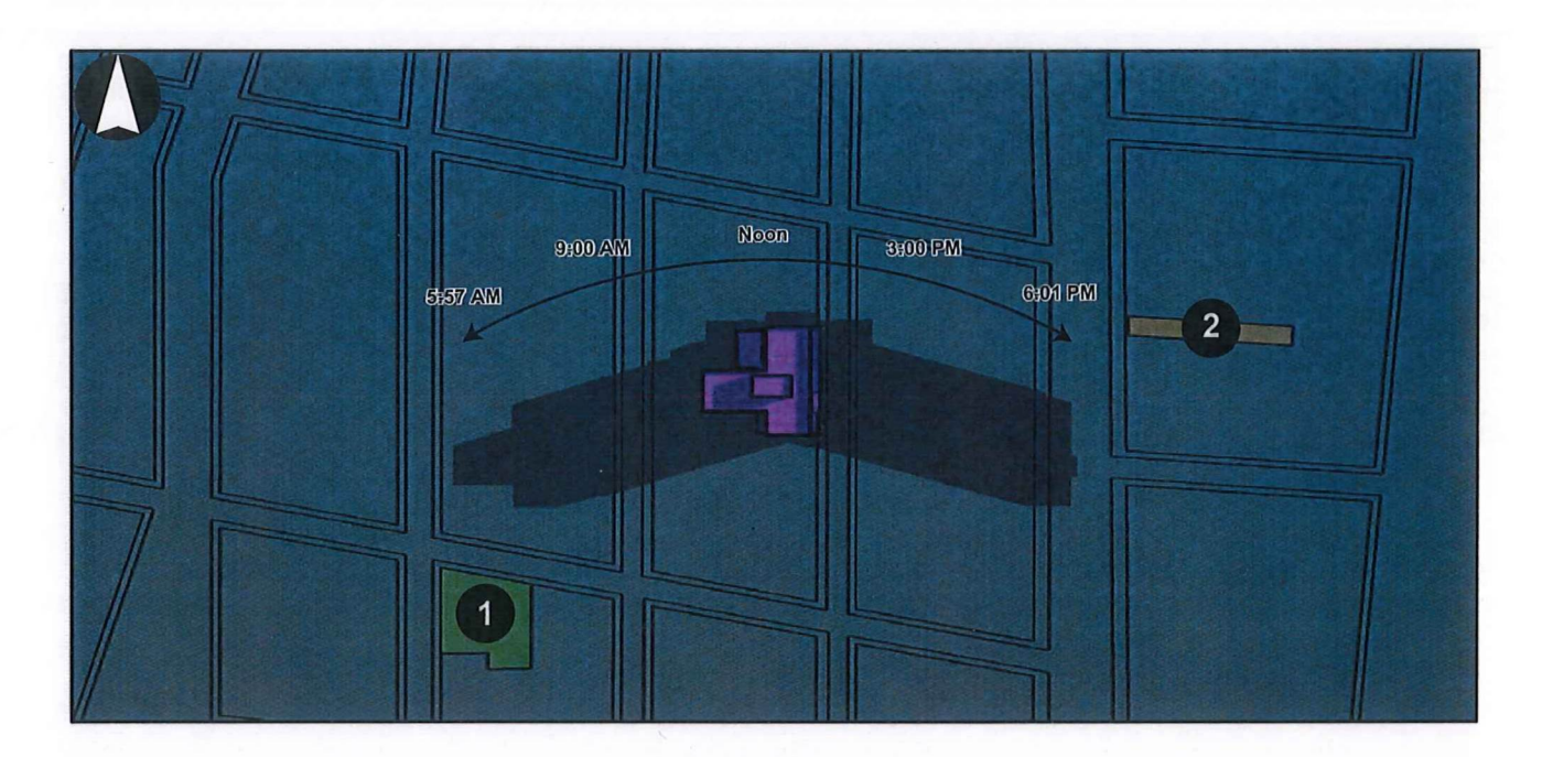
Figure B-2b Tier 3 Screening